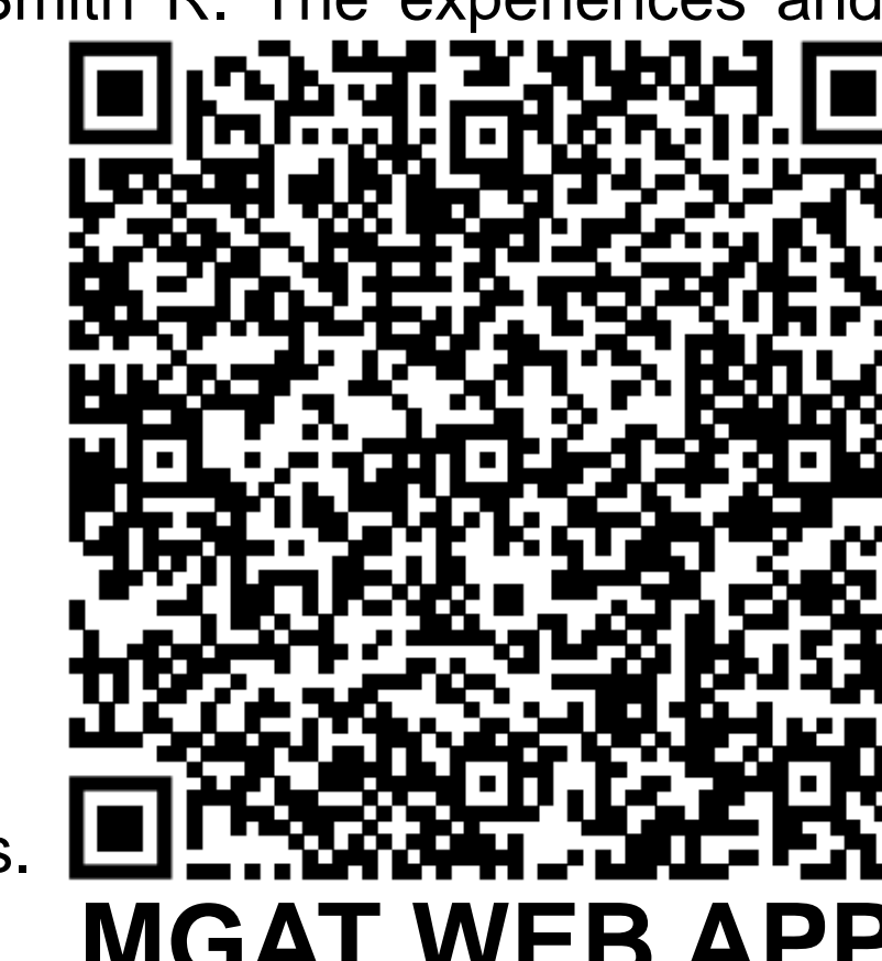
MGAT WEB APP